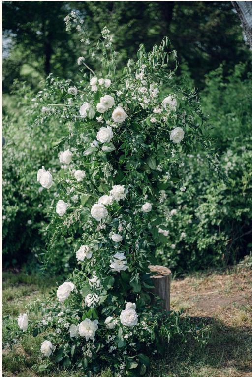
Work done by: Lavender Leaf Design