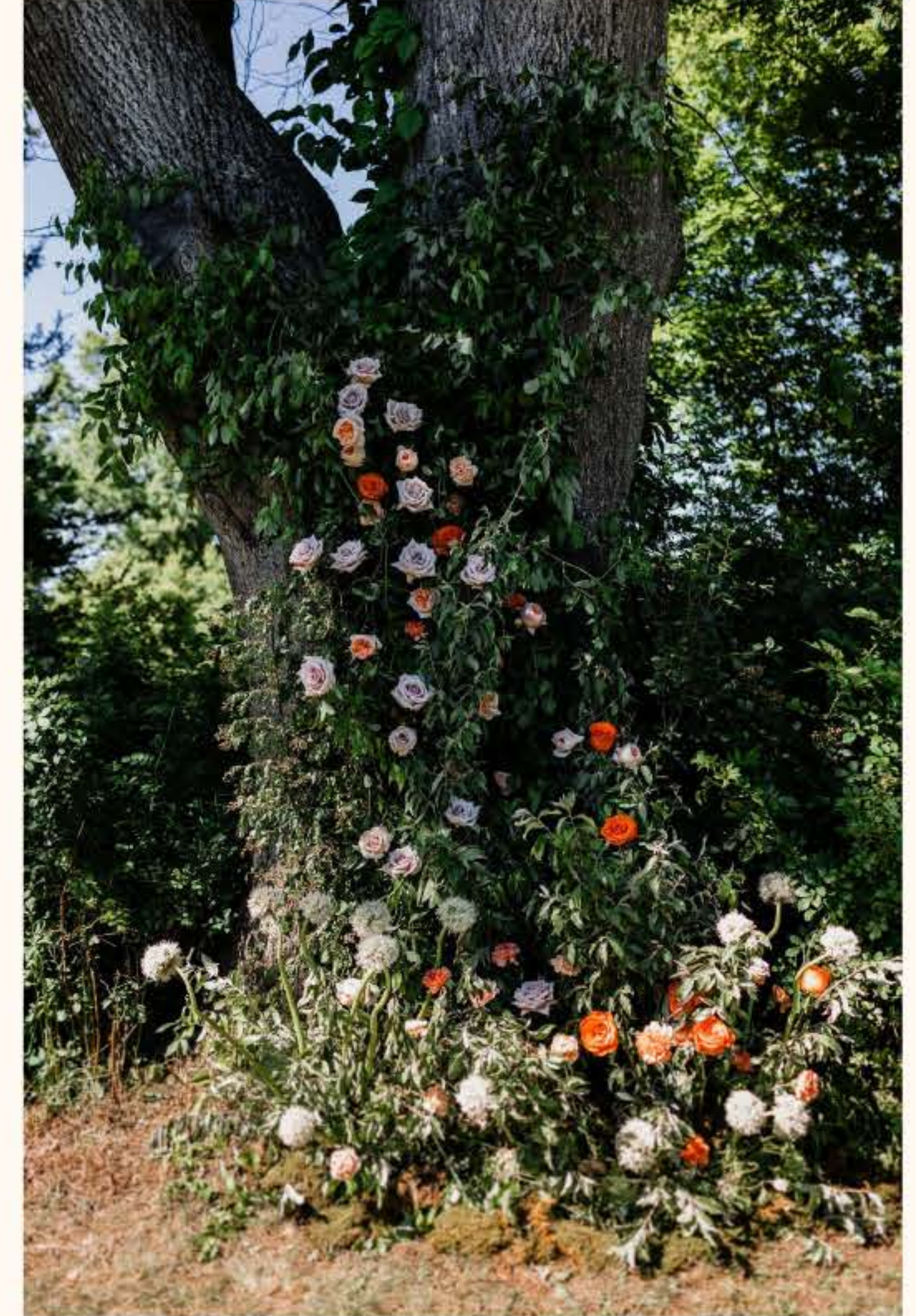
Work done by: Slate Florals