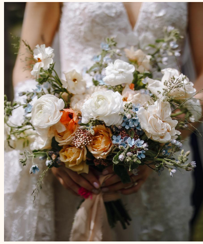
XL / cascading bridal bouquet