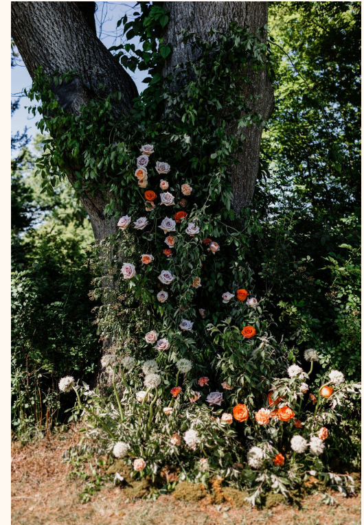
Work done by: Slate Florals