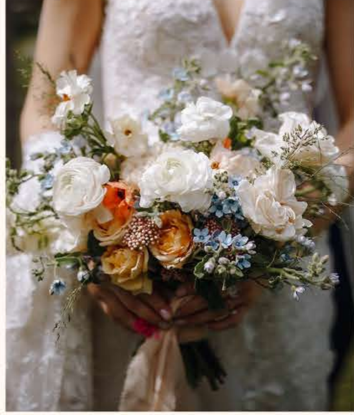
large bridal bouquet