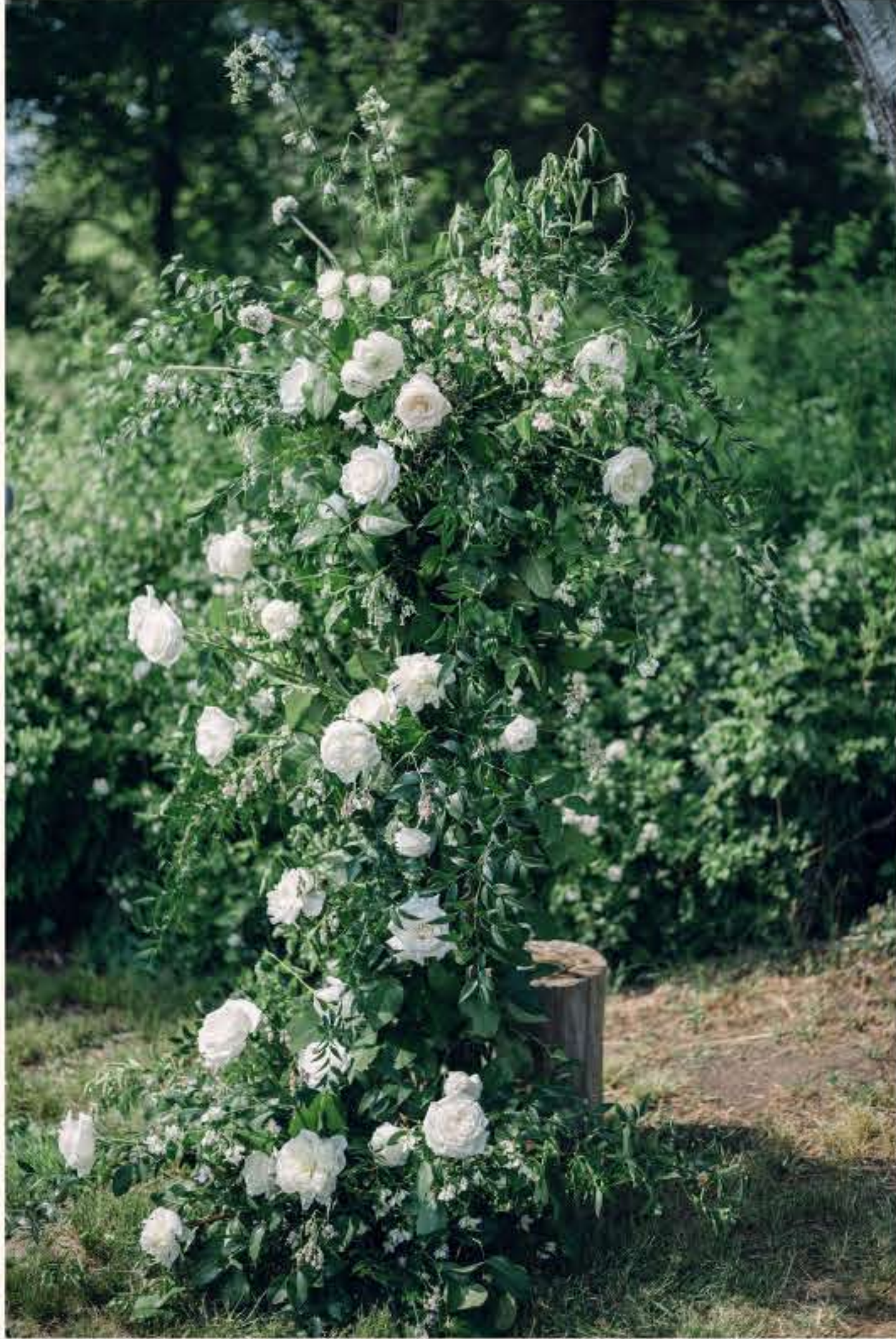
Work done by: Lavender Leaf Design