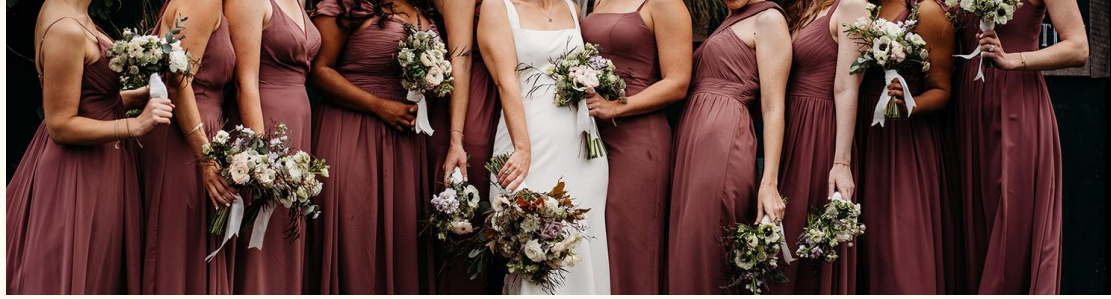
petite bridesmaid posy